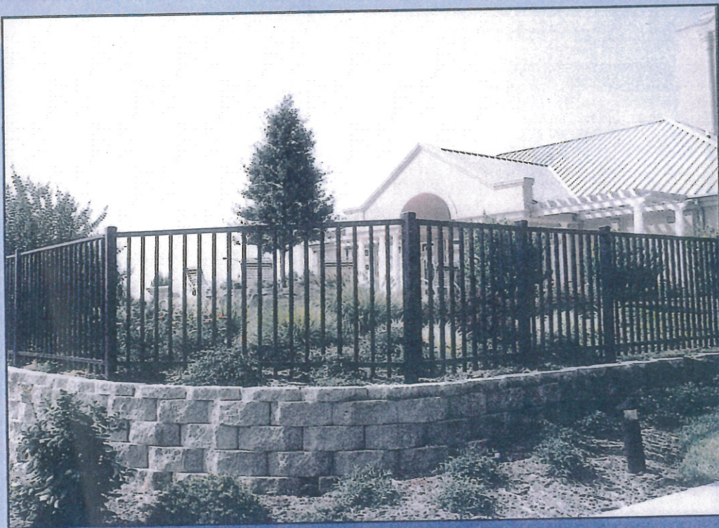
Atlanta Motor Speedway Atlanta, GA